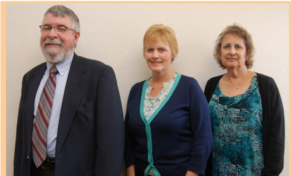
The District's Customer Service staff is available to assist you Monday through Friday, 8 AM to 5:30 PM.